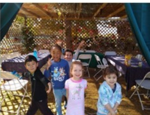
Kids in the new Sukkah