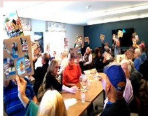
Art Session for Seniors