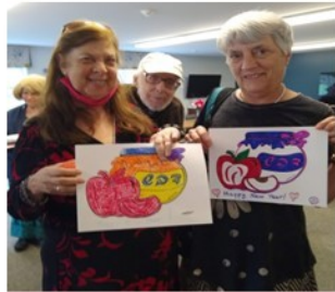
LEV for Rosh Hashanah